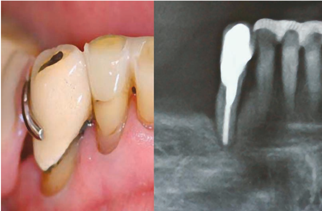
Fig. 1. a) Pre-existing crown supporting a removable partial denture (RPD). Fig. 1. b) Initial X-ray.